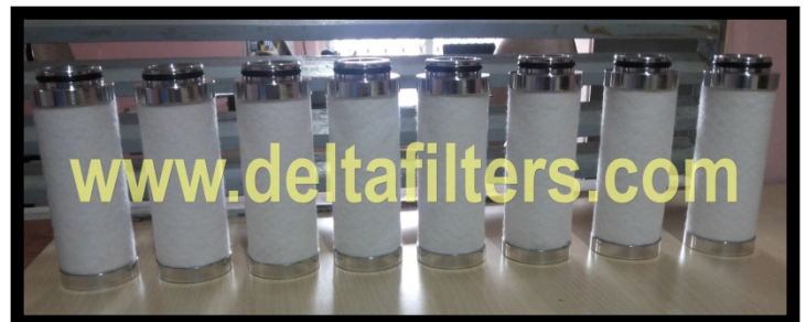
DELTA GlassFibre Cartridges